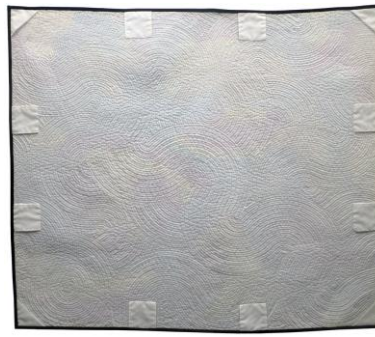
View of back of artwork